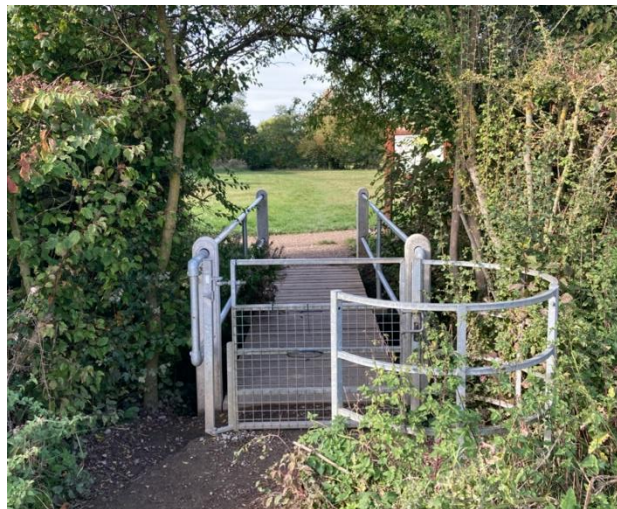
Figure 2 - depicts a similar bridge specification that could be installed.